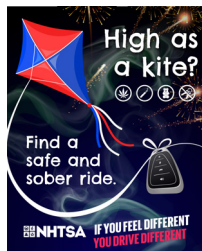
If You Feel Different, You Drive Different