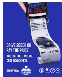
Drive Sober or Get Pulled Over