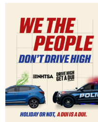
Drive High, Get a DUI